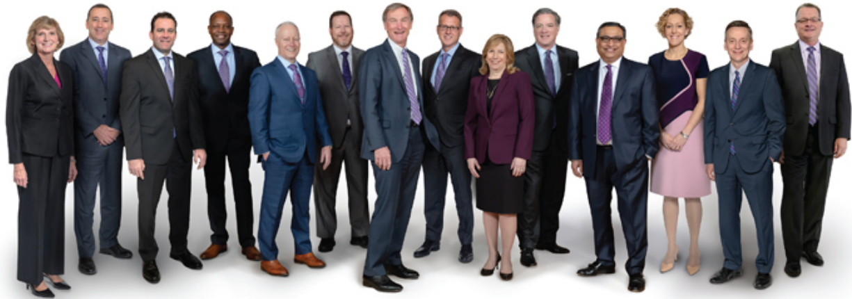
Executive Leadership Team