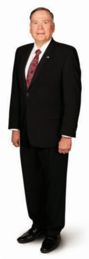
John P. Jumper Chairman of the Board and Chief Executive Officer

The past year, we began a new chapter in our history – one built on the great achievement of the past, but focused on the promise of tomorrow. We achieved a tremendous milestone with the successful spin-off of our technical services and enterprise information technology services business, and the continuation of our solutions business under the new name of Leidos. We accomplished all this while remaining steadfast in our commitment to supporting our customers.