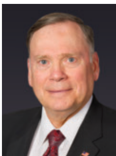
John P. Jumper Chairman of the Board and Chief Executive Officer