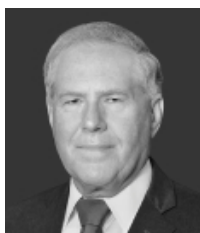
FRANK KENDALL III