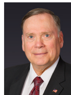
John P. Jumper Retired General, U.S. Air Force Former Chief Executive Officer