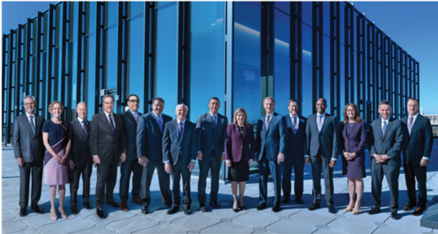
Leidos Executive Leadership Team